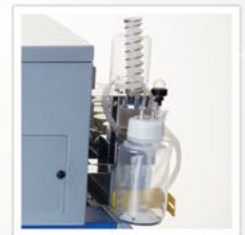
Unique Wet Cap System